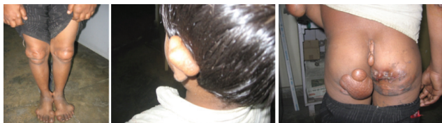
[Table/Fig-1-3]: Xanthomas over the ankle, metacarpophalangeal joints, post-aural and gluteal region.

thought to be neurofibromatosis, benign mesenchymal lesion or xanthomatosis. There was no history of diabetes mellitus, hypothyroidism, hepatic disease, or renal disease. On physical examination, multiple nodules of varying size were observed on the previously mentioned sites. Systemic examination was unremarkable. Investigations revealed total cholesterol of 713 mg/dl, low density lipoprotein cholesterol of 635.7mg/dl, high density lipoprotein cholesterol of 36.9 mg/dl and triglyceride of 160 mg/dl. Complete hemogram, blood sugar, renal function test, liver function test and thyroid function test were within normal limits. Electrocardiogram (ECG), treadmill tests (TMT) and echocardiography was done to look for the cardiovascular effects of hypercholesterolemia and they proved to be normal. The chest X-ray was normal, while that of hands and elbows showed multiple soft tissue swellings corresponding to cutaneous lesions and